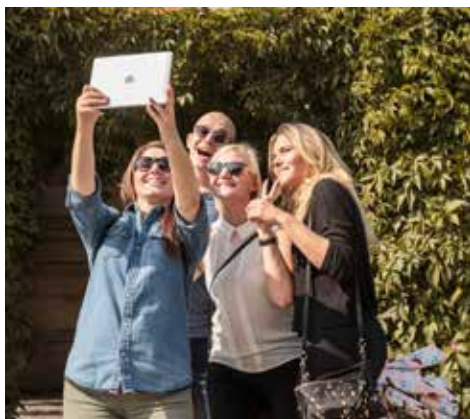
PHOTO HUNT CHALLENGE

Discover the Old Town of Tallinn through a customised digital scavenger hunt! The game combines physical activity, puzzles, and modern technology to take you on a journey through the medieval and modern aspects of the city. Find answers to questions related to interesting places around the historic town and explore hidden gems you might otherwise overlook. The game runs easily on any phone or tablet and can accommodate any number of participants. Come join us for an unforgettable adventure!